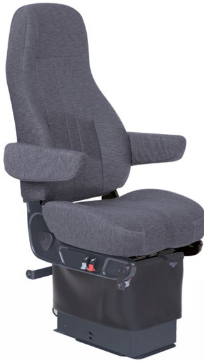
ROUTEMASTER 350 SCHOOL BUS SEAT WITH 21" WIDE CUSHION AND 95 "DUAL-SHOCK" SUSPENSION SHOWN: CHARCOAL MORDURA