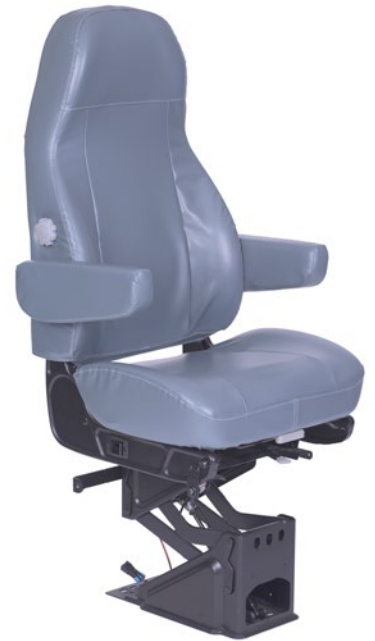
ROUTEMASTER 310 SCHOOL BUS SEAT WITH 21" WIDE CUSHION AND HEIGHT ADJUSTER SHOWN: GREY VINYL