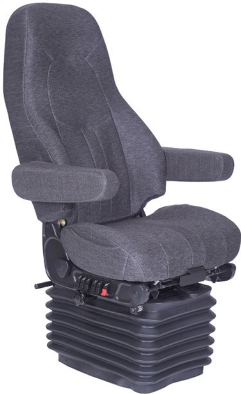
ROUTEMASTER 650 SCHOOL BUS SEAT WITH 21" WIDE CUSHION AND 95 "DUAL-SHOCK" SUSPENSION SHOWN: CHARCOAL MORDURA

These three models deliver all of the comfort features demanded by your drivers. The Routemaster series include a total of seven inches of fore/aft adjustment for improved pedal-reach over the competition's seats.