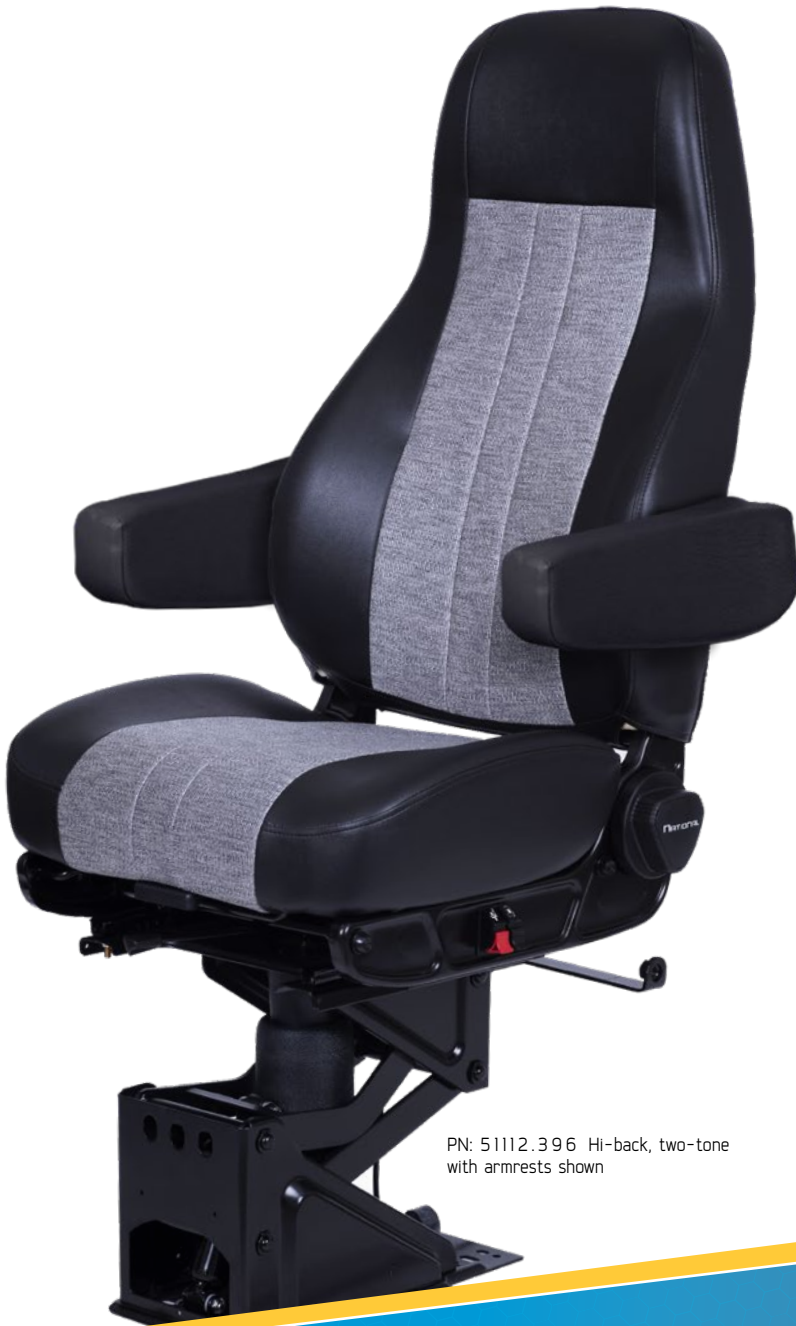
PN: 51112.396 Hi-back, two-tone with armrests shown

Now available with Ensign Lo suspension for medium-duty truck applications.