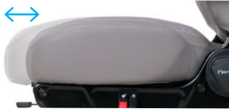
Cushion extension standard