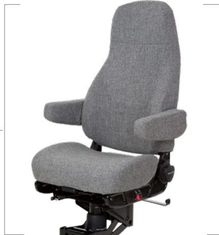
PN: 51110.331 Hi-back, Forever cloth with armrests shown.

Complete base number above with material & color code to a number below.