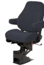
*Mid-back option not available on Ensign Lo